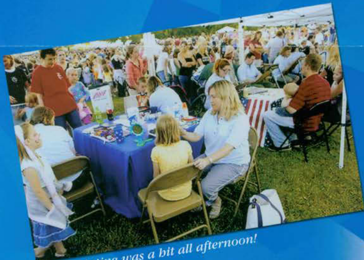
Face painting was a bit all afternoon!