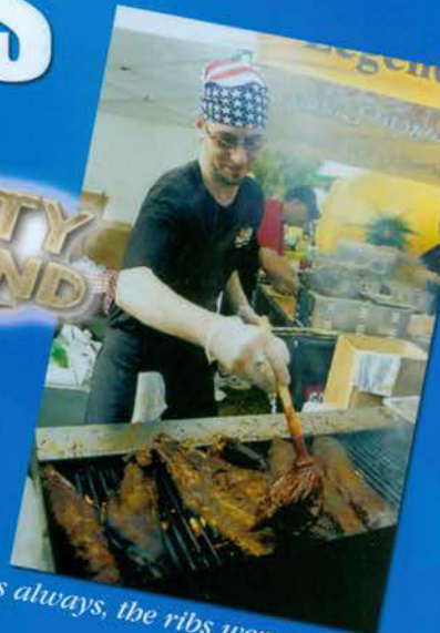
As always, the ribs were great!