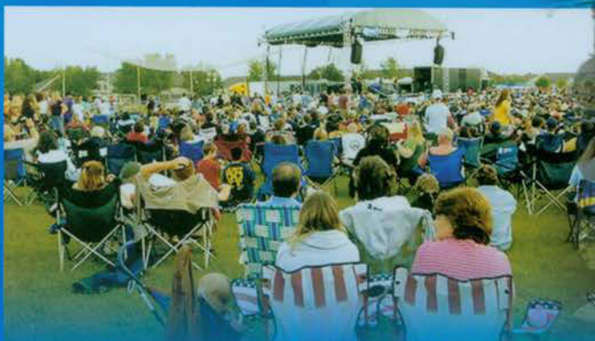
Once again, the crowds were huge and well entertained.