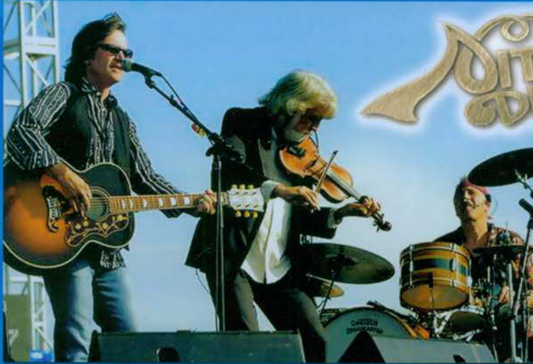
The Nitty Gritty Dirt Band between thunderstorms.